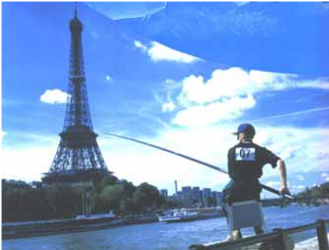
Paris, September 2001, the 48 th World Fishing Championship