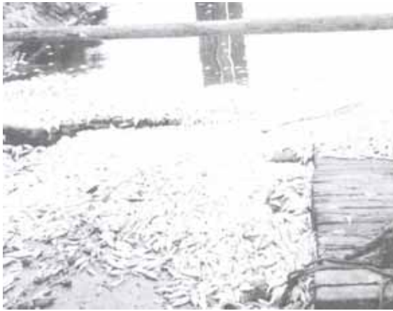
Fish mortality, 1968