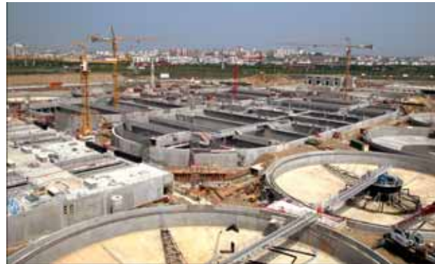
Seine amont treatment plant extension