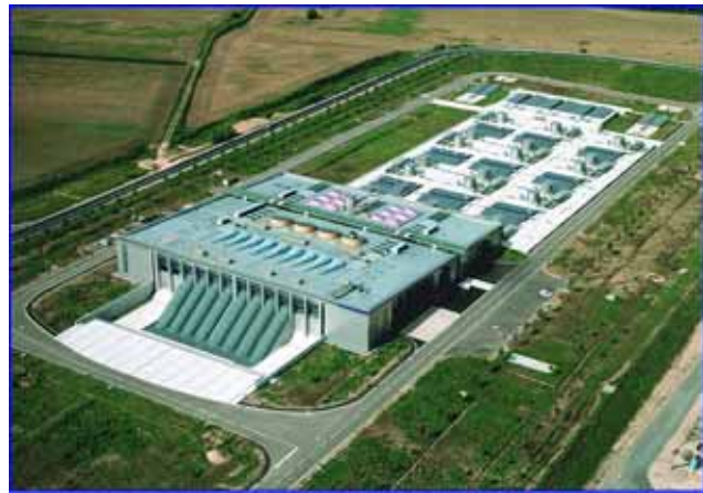
Storm water treatment plant (30 m 3 /s)

Following numerous discussions, it was decided in 1994 by the then Ministre de l'Environnement (French Ministry of the Environment) to launch a greater Paris waste water treatment study under the aegis of the French State and financed by the State, the Ile-de-France region, the S.I.A.A.P. and the Agence de l'Eau Seine Normandie (Seine Normandy Water Agency). The objective of this study was to propose improvements making it possible to set out future waste water treatment in the greater Paris area by integrating the requirements resulting from new urbanisations and limiting the impact of heavy rainfall periods on the Seine. This waste water treatment development plan should also take into account the necessity of limiting the capacity of the principal waste water treatment plants of the greater Paris area and the necessity of eliminating any nuisances for those living in the vicinity of the treatment works.