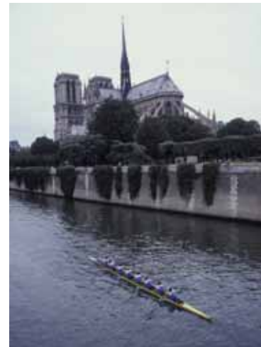
Recreational uses of water

The benefits of improved sewage treatment are also felt well downstream of the greater Paris area. Sizeable algal blooms develop, particularly in estuaries and fjords, coastal areas on the eastern side of the North Sea, the Wadden Sea and to the east of the Skagerrak. These algal blooms are due to the significant input of nutrients, which come in particular from the Seine. In fact, with regard to nitrogen containing pollutants, the different communities within the greater Paris area contribute between 20 and 40 % of the annual amount flowing into the North Sea. As for phosphorous, the same communities account for around 70 % of the amount discharged into the North Sea. In the Oslo - Paris Convention (1988), France committed itself