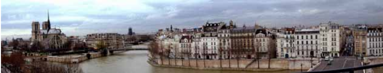
The Seine river banks have been classified as world UNESCO patrimony

Summary: The sewerage system that has been progressively constructed in the greater Paris area has enabled some very considerable progress to be made: eradication of water borne diseases, progressive restoration of the quality and the uses made of the river (leisure activities and drinking water supply), effectively combating the consequences of rain related events (floods and spillages of pollutants), restoration of the biological potentiality. However, there are still challenges that need to be faced, such as the management of by-products from waste water treatment and improving treatment in periods of heavy rainfall. The solutions being envisaged call for innovation within a framework of increased awareness of the challenges involved in sustainable development.