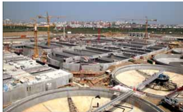
Seine amont treatment plant extension