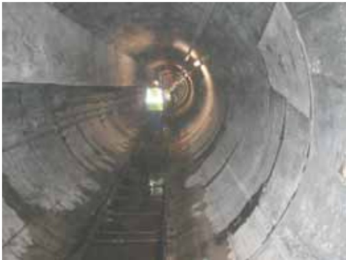
Storm water storage tunnel

In order to implement the waste water treatment scenario chosen in 1997, a Contract known as a Basin Contract tying together the SIAAP, the Ile de France region and the Seine Normandie Water Agency was signed on the 6 th March 2000. This contract, which extends for 6 years, concerns the completion or the modernisation of the principal water treatment works, the construction of retention structures and pollution treatment in periods of heavy rainfall, as well as the completion of major collection structures. This contract involves a sum of 2500 M€ (not including tax) for the period 1999-2006, i.e. 340 M€/year. The estimations for the next period of investment concerning the improvement of the treatment plants (2006-2012) are around 2000 M€.